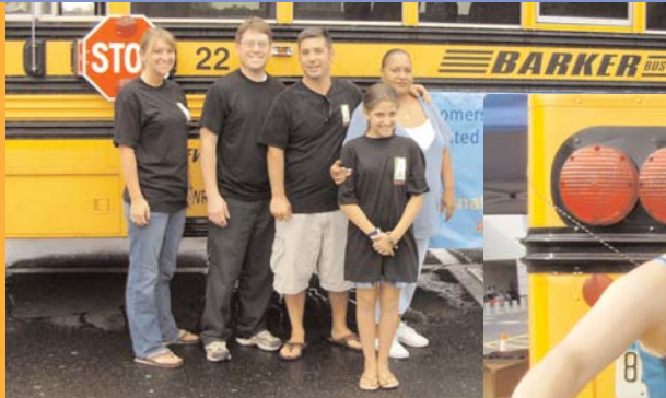
Kohl's hosts a "Stuff The Bus" event at their Watchung location.