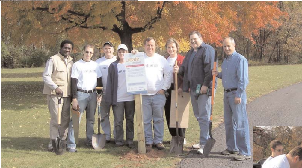
Johnson & Johnson Volunteers dig, paint and construct the Born Learning Trail at Duke Island Park in Bridgewater.